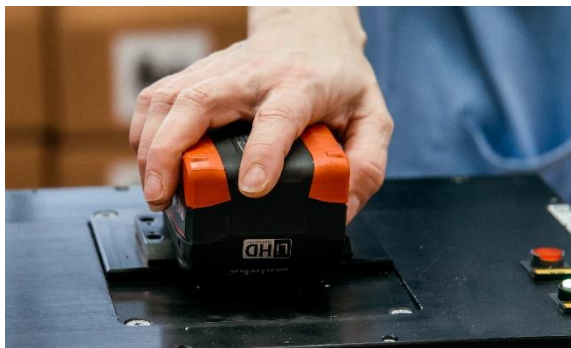
Li-ion rechargeable batteries